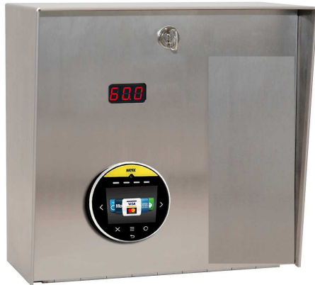
Ems 1010 nayax onyx